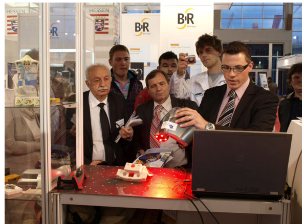
Picture 3: Live 3D scanning presentation to expert commission for awards "Step into the Future"