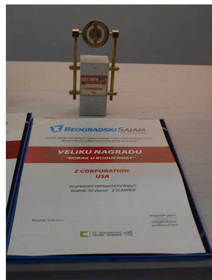
Picture 4: An award and acknowledgement »Step into the Fututre« for 3D scanner ZScanner 800 (ZCorporation)

Among a great number of products ZScanner 800, manufactured by Z Corporation, presented by IB-PROCADD d.o.o., was awarded for the first place "Step into the Future".